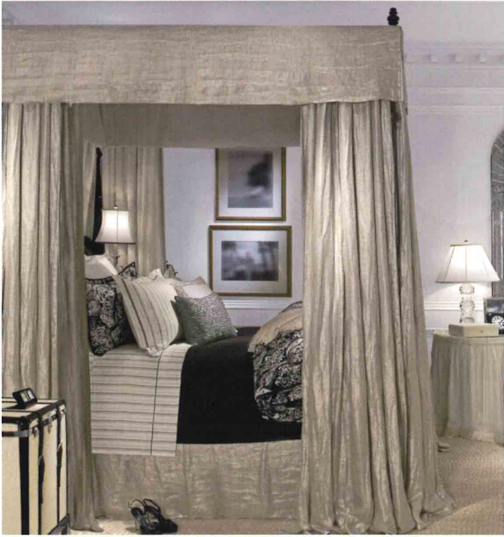
Left: The Mayfair collection by Ralph Lauren Home. Right: Lalique Vase Bacchantes Gris. Below: The Heiress collection by Ralph Lauren Home.