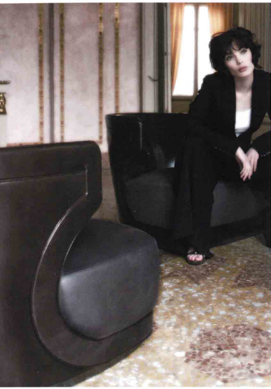
Left: The Etienne chair by Baxter. Right: Jacques Garcia Biarritz dining table and Mondetour side chairs from Baker Furniture. Below: Thomas Pheasant Paris sofa and Belair lounge chair for Baxter.